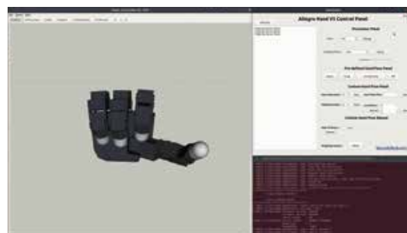
Hand Control with GUI